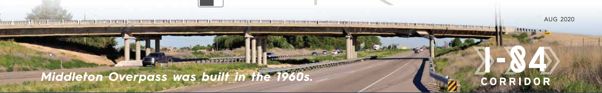
Middleton Overpass was built in the 1960s.