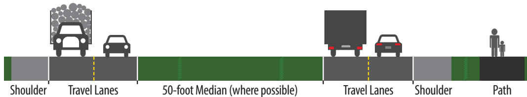
Typical ID-41 Cross Section by 2022

These improvements have been planned with and are financially supported by the cities of Post Falls and Rathdrum. Not all construction costs have been finalized. However, construction of Prairie to Boekel has been awarded for $31.5 million.